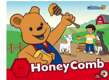
Workbook for 2024/2025